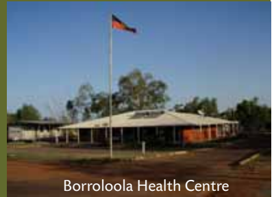
Borroloola Health Centre